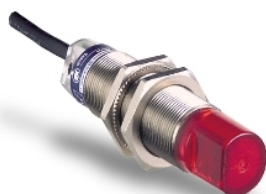
photo-electric sensor - XUB - emitter - 90° - 12..24VDC - cable 2m