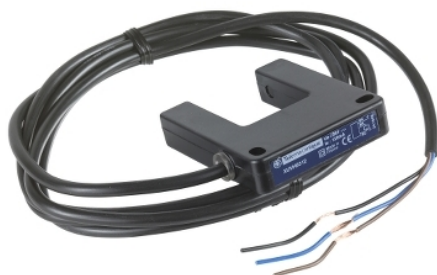
photo-electric sensor - XUV - fork - handling - 30X30mm - 12..24VDC - cable 2m